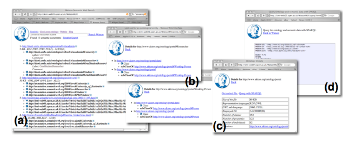
Figure 2. The Watson Web interface (http://watson.kmi.open.ac.uk/WatsonWUI).

SPARQL. A SPARQL endpoint has been deployed on the Watson server and is customizable to the semantic document to be queried. This endpoint is implemented thanks to the Joseki SPARQL server for Jena<sup>9</sup>. A simple interface (Figure 2(d)) allows to enter a SPARQL query and to execute it on the selected semantic document. This feature can be seen as the last step of a chain of selection and access task using the Watson web interface. Indeed, keyword search and ontology exploring allow the user to select the appropriate semantic document to be queried. Our plan is to extend this feature to be able to query not only one semantic document at a time, but also to automatically retrieve the semantic data useful for answering the query. This kind of feature, querying a whole repository instead of a single document, has been implemented in the OntoSearch2 system [11].