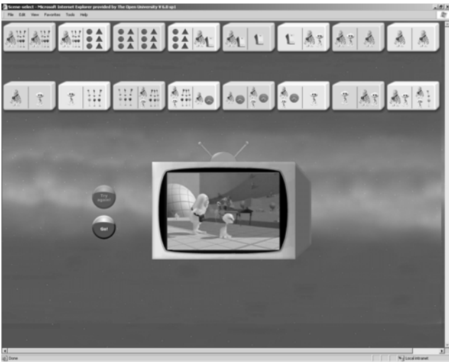
Figure 3. A completed game (taken from complete-explicit)

In the top-left of the screen is an “inter” tile that are used in both the complete explicit and rewrite games for continuity and to aid the child in matching tiles to scenes. In a complete-explicit game the “inter” takes the form of a different coloured tile, that matches