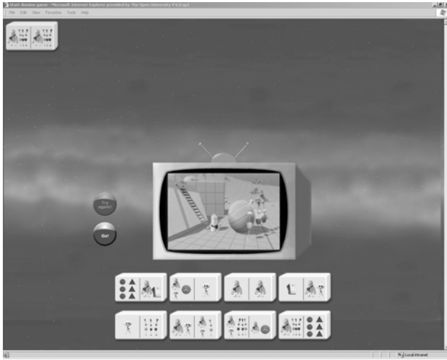
Figure 2. Starting the game (taken from complete-explicit)

When starting the game, a scene is played on a “television” in the centre of the screen. In figure 2 this scene involves Bing and 3 flockers trying to push a ball up a ramp.