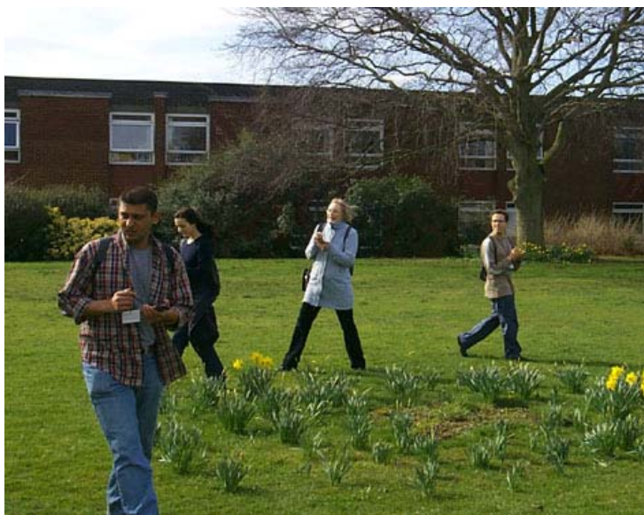
Figure 2. CitiTag in action: a user trial at the Open University's campus