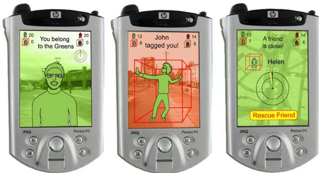
Figure 1. Three different game states. Figures on top of the screen show the number of free and tagged players for each team.

CitiTag is a multiplayer team game. It is played using GPS (Global Positioning System) enabled, handheld, PocketPCs connected to a wireless network. As a player, you belong to either of two teams (Reds or Greens) and you roam the city, trying to find players from the opposite team to 'tag'. When your PocketPC detects a player of the opposite team in the neighbourhood you get the opportunity to 'tag' that player. You can also get 'tagged' if one of them gets close to you. If this happens, you need to try and find someone from your team in vicinity to set you free, 'untag' you. Each game event (e.g. someone is close and you can tag/untag them) appears as an alert on the iPaq with a sound (Fig. 1). A team wins by tagging all of the players on the opposing team.