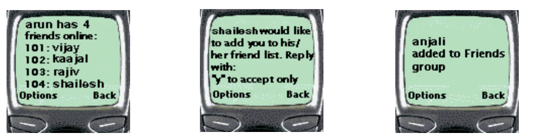
Screenshots of Yahoo! Messenger for mobile phones, which is based on SMS, using specified commands and codes to organise contact lists and send instant messages (http://messenger.yahoo.com/messenger/wireless).

Presence is the key feature that differentiates wireless Instant Messaging to the existing SMS messaging facility on mobile phones. Without presence, the user does not know of a person's availability or device status. Presence is a constantly evolving dynamic construct with a great potential for future telecommunication applications.